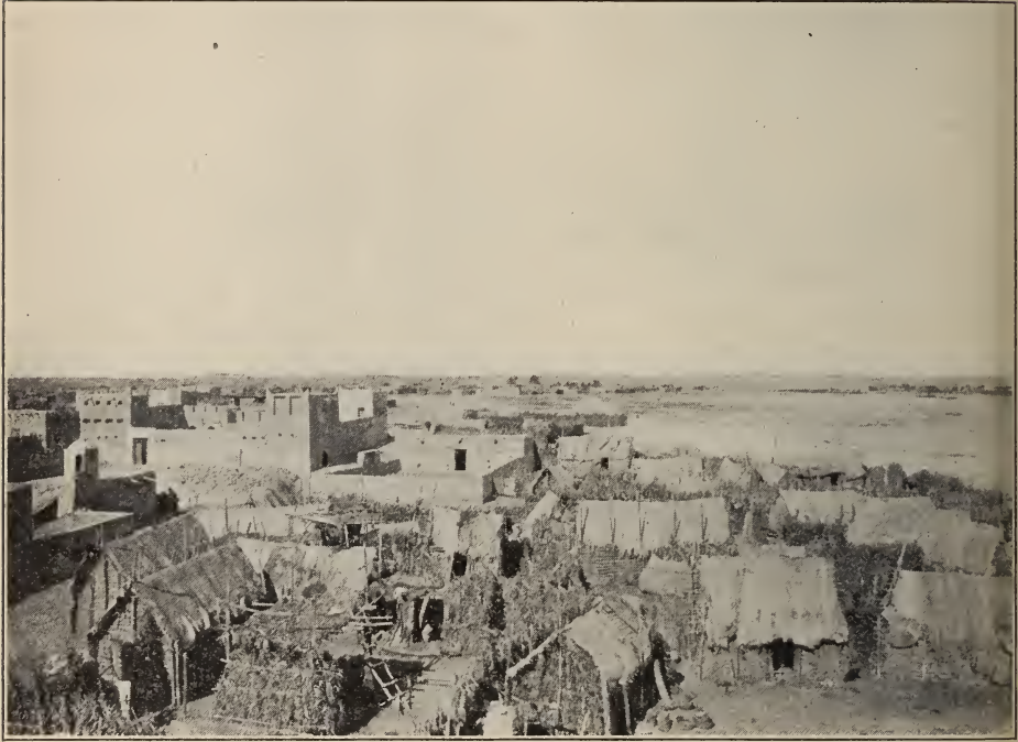
VIEW FROM MISSION HOUSE, BAHREIN, LOOKING NORTHEAST TOWARD MOHARREK.

had gathered before the door. Most of these were only loafers curious to see what we were going to do. Some had aches and pains or bad eyes to be treated, and each waited for another to come up first, but finally they began to come in. After they had told their story and were examined they were treated. Some came up with their arms extended that the doctor might feel their pulse, for they have an idea that a doctor needs only to feel the